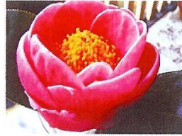
Camellia amplexicaulis from the Vietnamese and Chinese border