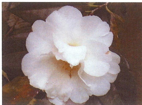
Camellia japonica 'Southern Charm', one of many garden cultivars now disappearing from Australia